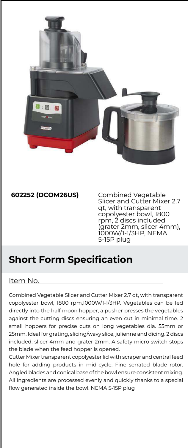
602252 (DCOM26US) Combined Vegetable Slicer and Cutter Mixer 2.7 qt, with transparent copolyester bowl, 1800 rpm, 2 discs included (grater 2mm, slicer 4mm), 1000W/1-1/3HP, NEMA 5-15P plug